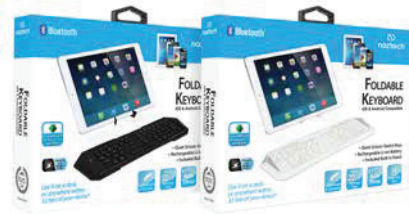
Universal Stand for Various Tablet Sizes & Smartphones