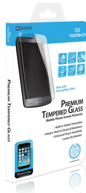
All packaging is coordinated to indicate product compatibility; package image is for reference only.